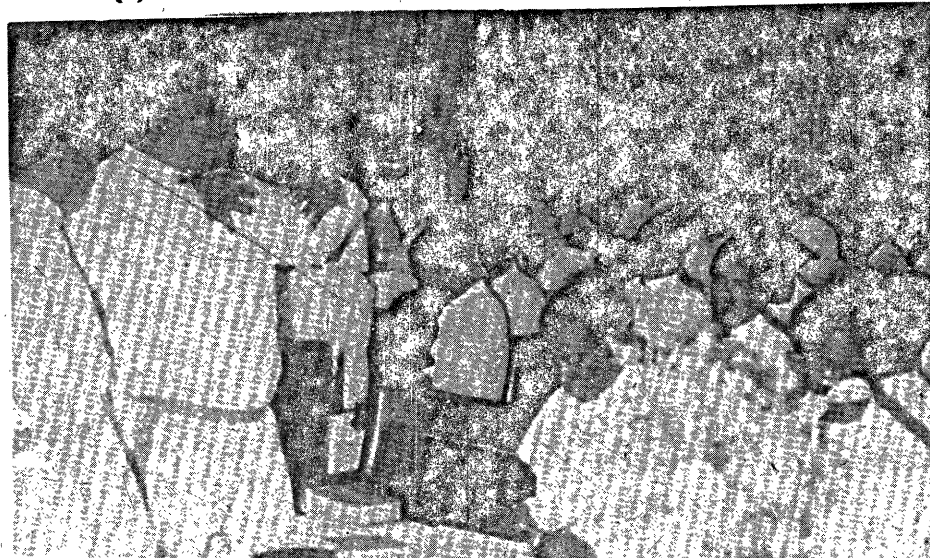
The Apostles/Evangelists fellowship Chairman addressing members during their meeting.

He warned against being in friendship with the world for "whosoever loves the world and the things therein, the love of