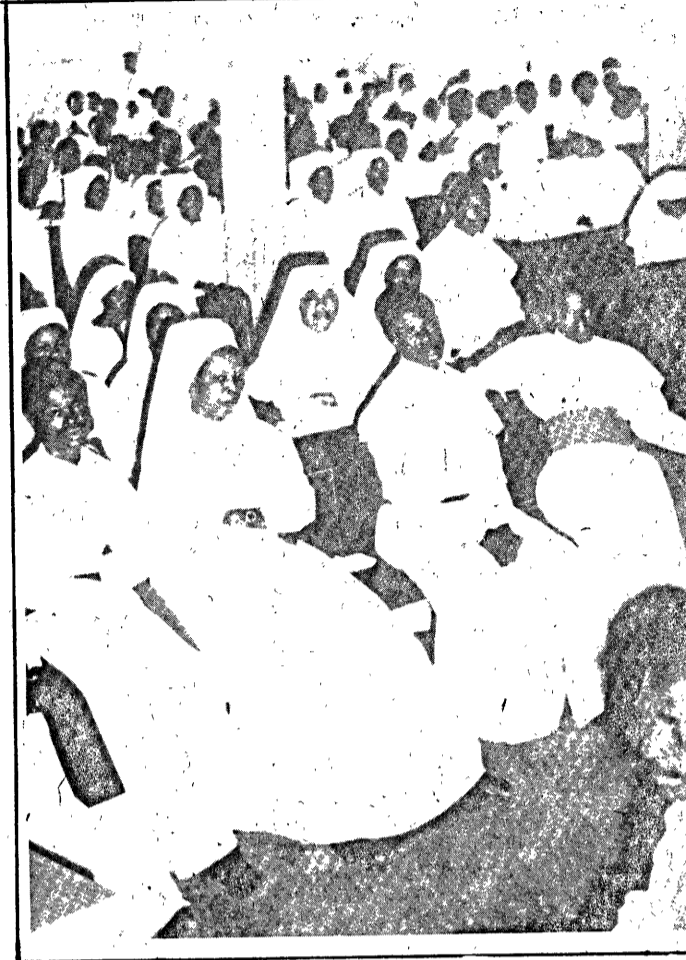
In this age God's words and promises are fulfilled

What does Brotherhood use in doing her work? This Holy Biakpan water is an open stream. Holy oil is made out of water. When you look at it, what more is there apart from